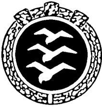
2.2.2 Three Diamonds Badge (1 & 2 Diamonds similar)