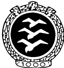
2.2.3 750 Kilometre and more Badges (1000 km illustrated, others and with one and two Diamonds, similar.)