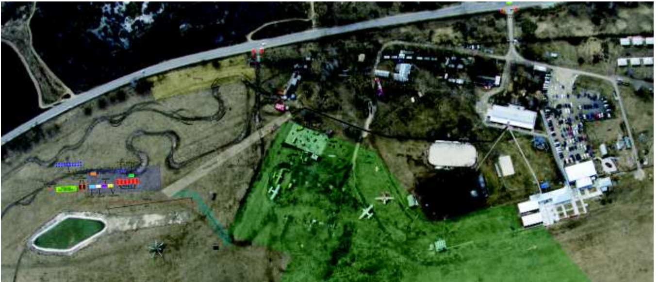
Swoop Pond Diagram