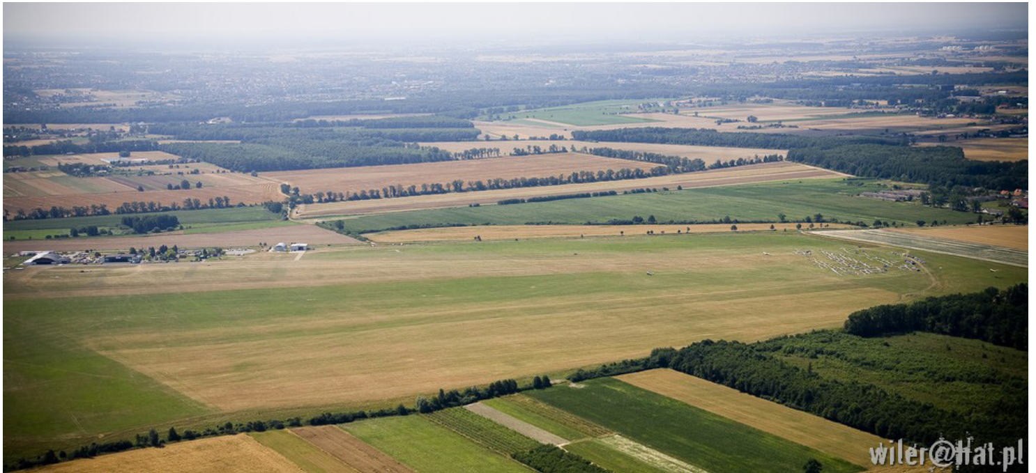
Photo: View of the Airfield Looking South

2.3.1 Airfield details: Total area of the airfield is approximately 95 Hectares