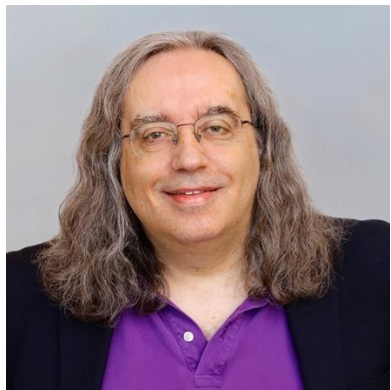
Dr. Jonathan McDowell