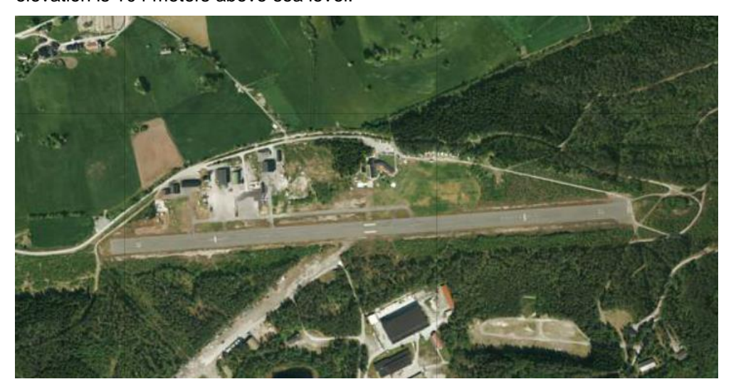
Google maps link: <a href="https://goo.gl/maps/7m5qbbjkgjiUc6a56">https://goo.gl/maps/7m5qbbjkgjiUc6a56</a>

Skydive Voss is in the district of Hordaland, close to the west coast of Norway. The field elevation is 104 meters above sea level.